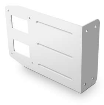
MASKCL-W L-shaped side bracket for MASK4C(T)-W / MASK6C(T)-W