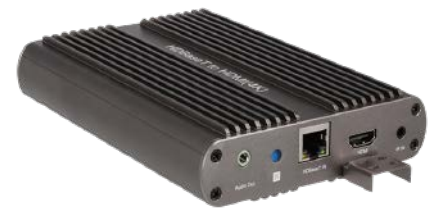
HDBaseT Receiver (Optional)