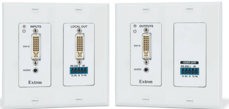
DTP DVI 4K 230 D Tx