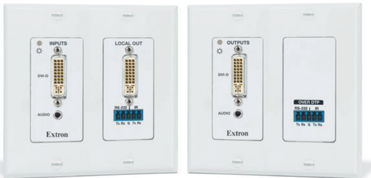
DTP DVI 4K 230 D Tx