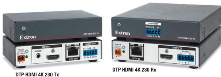
DTP HDMI 4K 230 Tx