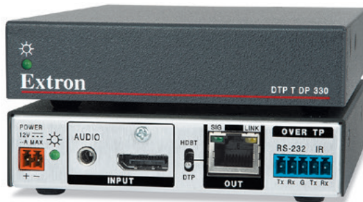
DTP T DP 4K 330