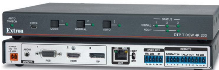
DTP T DSW 4K 233