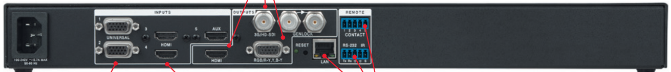
DVS 605 D - Back

Selectable output rates are available up to 1920x1200, including HDTV 1080p and 2048x1080.