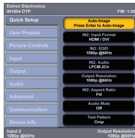
The IN1604 features intuitive on-screen menus for setup, operation, and monitoring using the front panel controls.