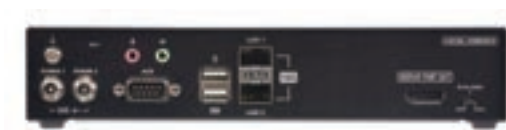
KX9970FT Rear View