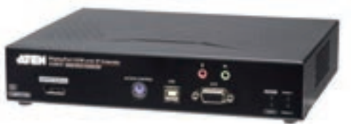
KX9970T Rear View