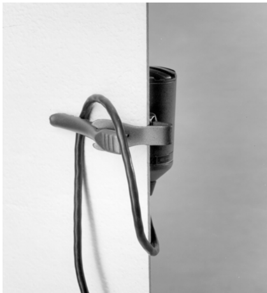
CABLE ANCHORING FIGURE 4

Insert the SM11 in the tie clasp and anchor the cable as shown in Figure 4. Affix the clasp to a tie, shirt, or blouse. Note that the microphone can be swiveled 360° in its holder for left, right, or vertical (“pen clip”) use.